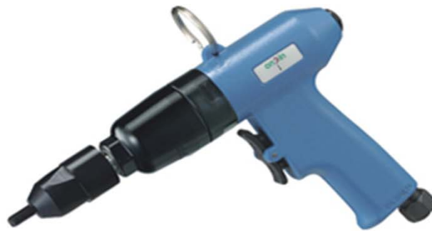
OP-601LC Handle exhaust 下排氣